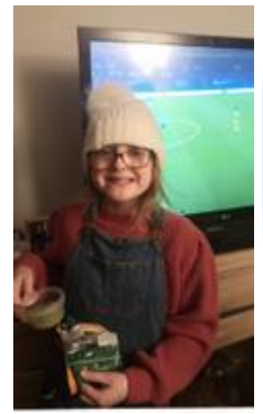
Football theme night with pie and mushy peas for tea!