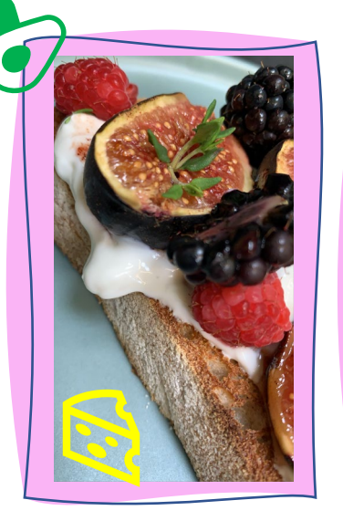
Honey figs on toast