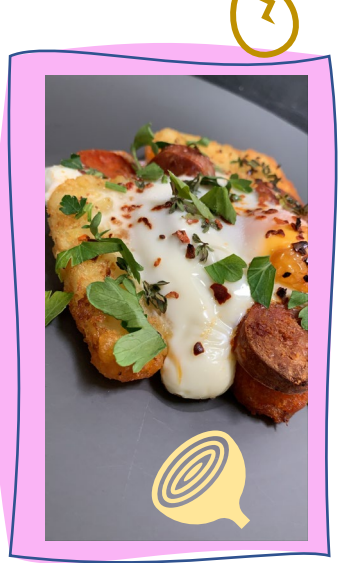
Chorizo, egg & hash brown bake