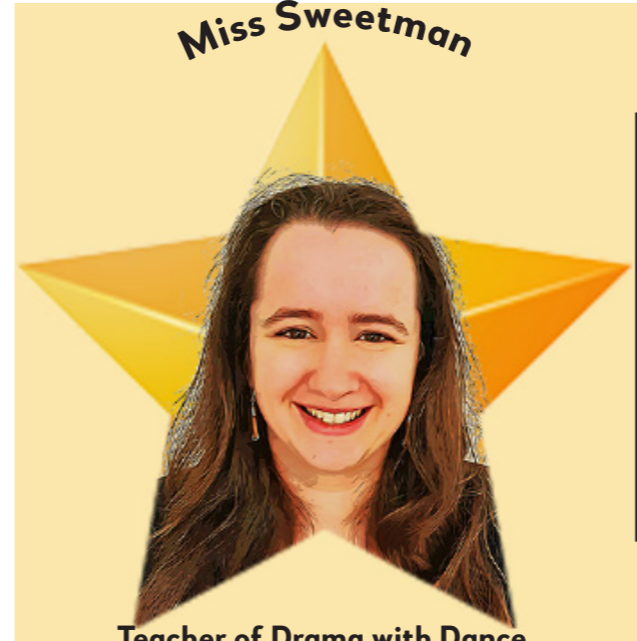
Teacher of Drama with Dance

'I am really looking forward to teaching at UVHS in September and becoming part of such a dynamic and friendly school community. I have been dancing and acting on stage since I was three years old and can't wait to share my skills, knowledge, and experience with my students. I have spent many family holidays in and around the Duddon valley but, as two of my main hobbies are walking and photography, I am especially looking forward to exploring parts of Cumbria that I am less familiar with.'