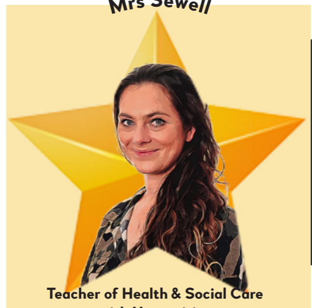
Teacher of Health & Social Care with Humanities

'I am delighted to be joining such a diverse school and I look forward to the upcoming year and getting to know the UVHS community well. It has been my vocation to inspire students to be the very best versions of themselves whilst creating independent thinkers and life-long learners. I'm excited to introduce concepts into the curriculum related to life and social skills as well as imparting my specialism in humanities to assist our students on their individual learning journeys. I have a keen interest in the extra-curricular life of the school and I hope to support skills driven by student request.'